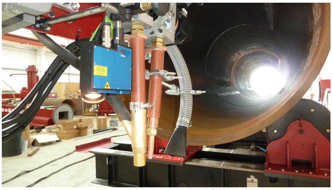
The MetaView sensor mounted on a tandem SAW head.

The new, all-digital MetaView combines a laser-camera sensor head with a colour touchscreen video monitor.